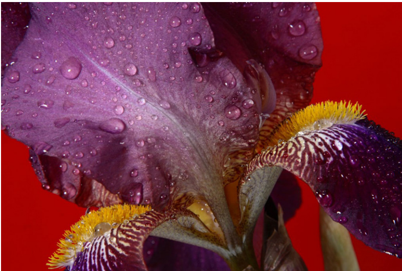
"Iris in Red" by T.W. Woodruff