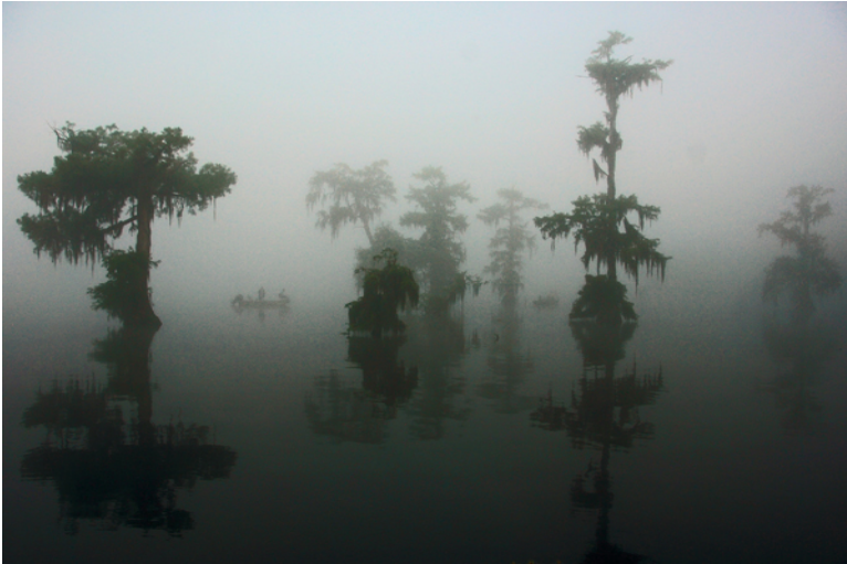
"Fishermen in the Fog" by Sherwood Cherry