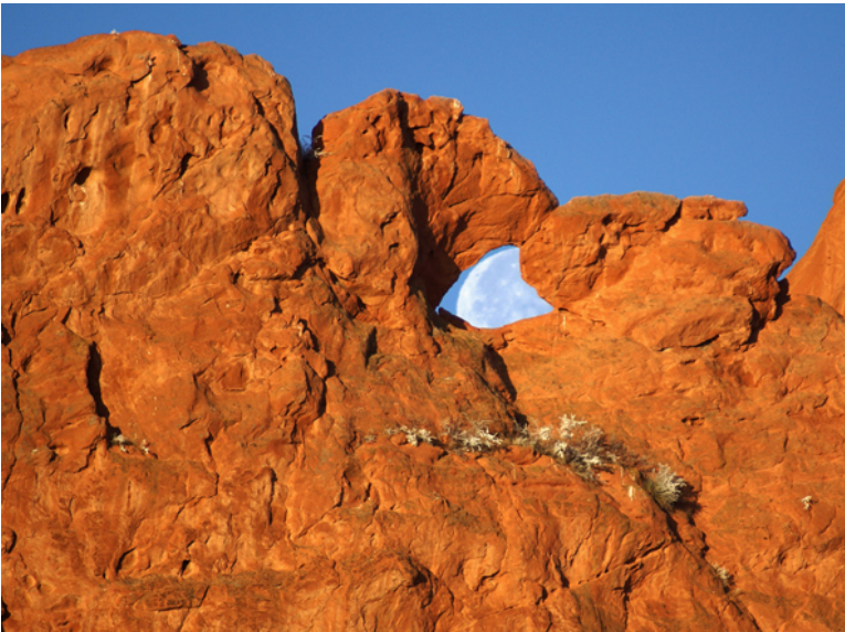
“Moon Light Kiss” by Yolanda Venzor