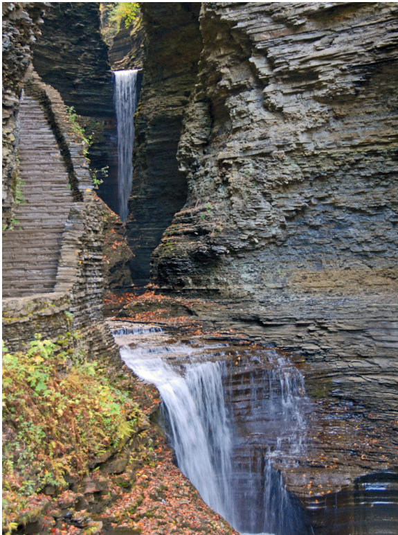
“Watkins Glen” by Sherwood Cherry